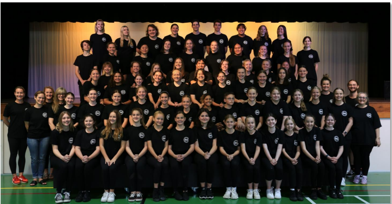
2021 Musical Cast